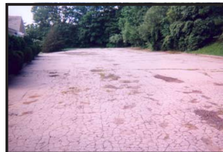
The parking lot that needs to be paved