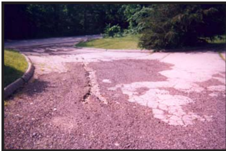
Driveway that needs to be paved