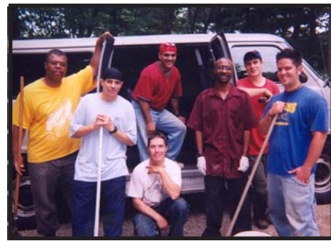
“The Ranch” Staff & Students