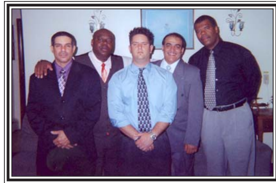
Broken Menthat are being Restored!