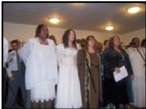
YC Students and Alumni