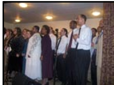
YC Students and Alumni