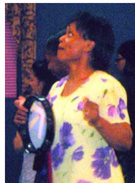
From Prison To Praise!

God has already started the process of restoration with my children. I know that it was God that saved me. Yes, the best is yet to come! I'm so glad the Lord didn't allow me to self-destruct and end my life. When nothing else could help, it was the love of God Almighty that lifted me. "Therefore, if anyone is in Christ, he is a new creation; the old has gone, the new has come!" 2 Cor. 5:17 (NIV) THANK YOU, JESUS!!